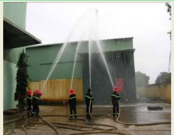
Annual safety training for workers and staff.