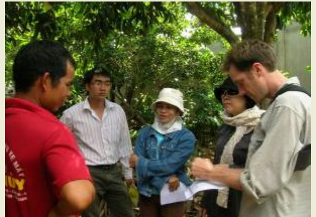
International independent investigation.