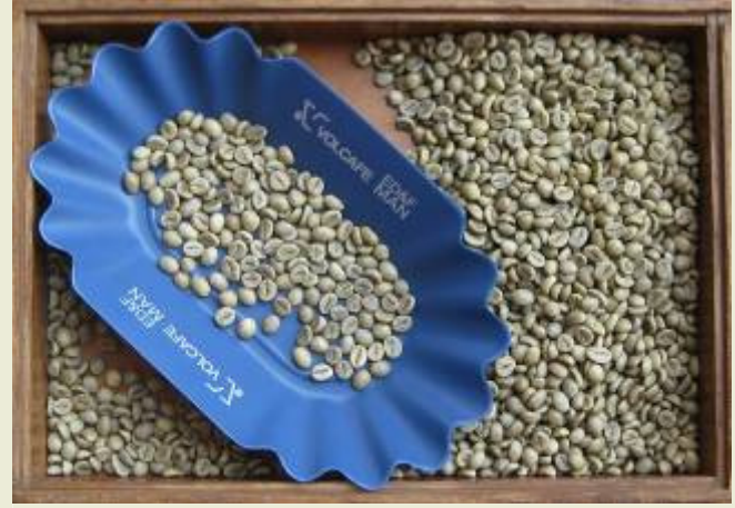
Quality checks at both ends: on delivery to the factory and to the port.