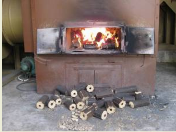
Rice husk has replaced coal as a more sustainable means to dry coffee.