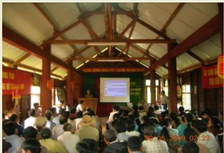
RFA and GAP training held in minority traditional community house