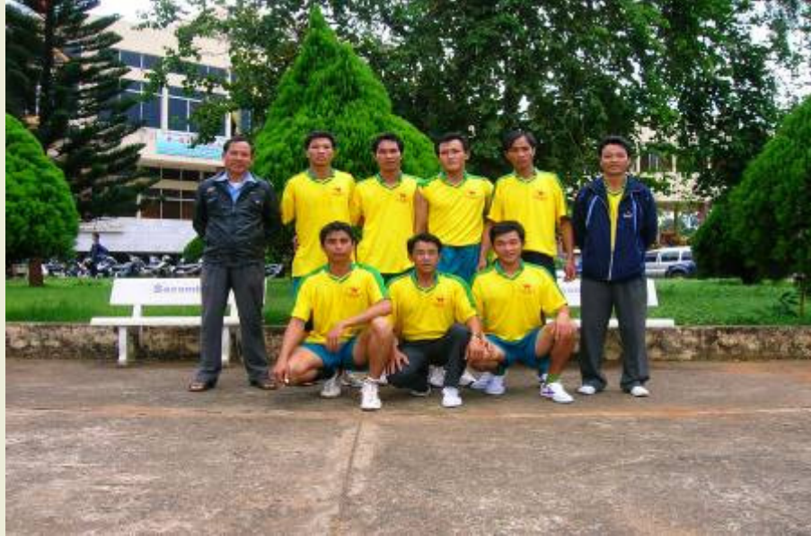
Sponsor for the local sports team